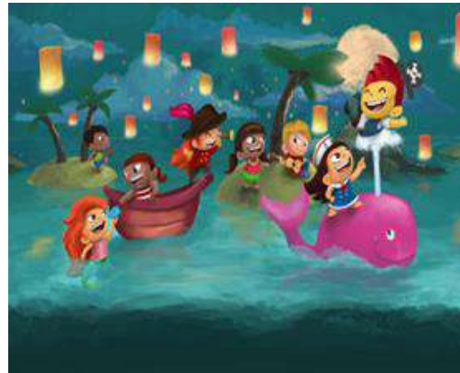
Water World - feelings