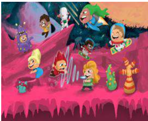
Space World - illness