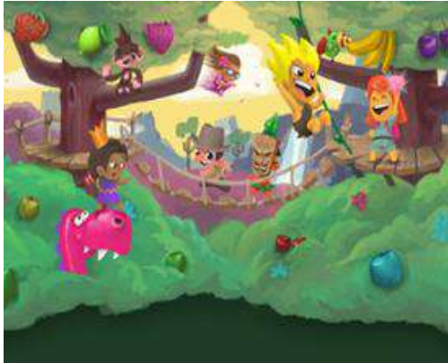
Rumble in the Jungle – staying healthy

Health for kids is presented to children through four themed worlds. Each world presents health advice through fun facts, quizzes, games or films.