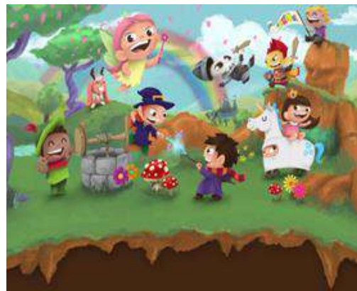
Magical World – getting help